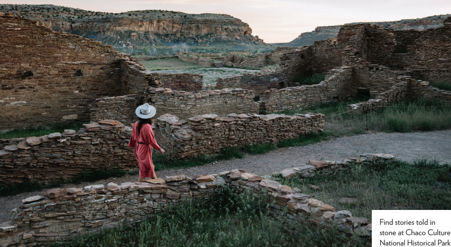
Find stories told in stone at Chaco Culture National Historical Park.