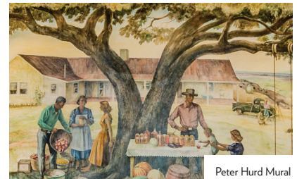
Peter Hurd Mural

New Mexico is known for its dramatic landscapes, but what you can't experience in a photo is the rich history and characters that bring its scenery to life. This summer, bring your family to discover the Land of Enchantment's vibrant markets, Native communities, and memorable traditions. You'll find handcrafted pottery and turquoise jewelry, along with fresh, one-of-a-kind cuisine in the chile capital of the world. Set your soul to roam—adventure awaits.