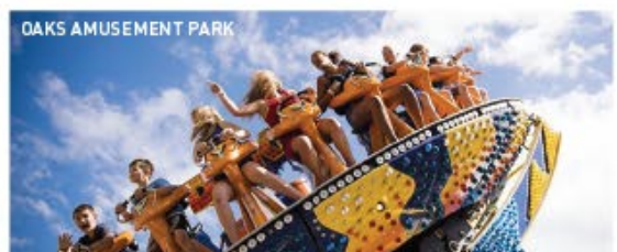
OAKS AMUSEMENT PARK