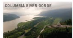
COLUMBIA RIVER GORGE

For additional resources, please contact: