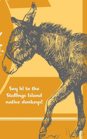
Say hi to the Stallings Island native donkeys!

THE ISLAND IS PRIVATE PROPERTY, AND THE ANIMALS COULD BECOME AGGRESSIVE IF APPROACHED.