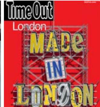
Time Out London (print) Emma Hughes circa 310,000