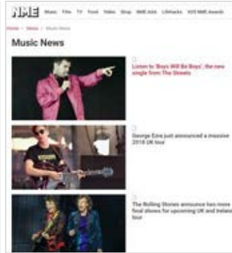
NME (online) Leonie Cooper Reach 12 million