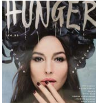
Hunger (print and online) Holly Fraser Reach 47,000