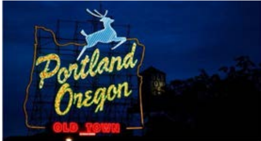
Discover the very best of the Pacific Northwest.

MADE IN PORTLAND: The creative capital of the Pacific Northwest and unrivalled Hoppy mecca is taking over The Old Truman Brewery. Discover Portland's most inspired experts, chat to local designers, watch live mural making, and get inked with a free vegan tattoo. The Old Truman Brewery (Brick Lane), free, just turn up, 11am-7pm, until 27 May